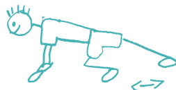
CHARGE YOUR BATTERY