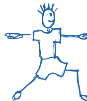
SURFER DUDETTTE 2