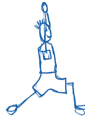
SURFER DUDETTTE 1